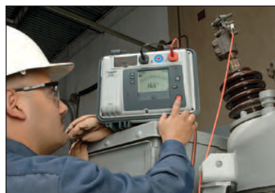
Circuit breaker being tested with the S1-552/2