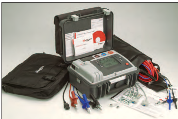
S1-554/2 shown with included accessories