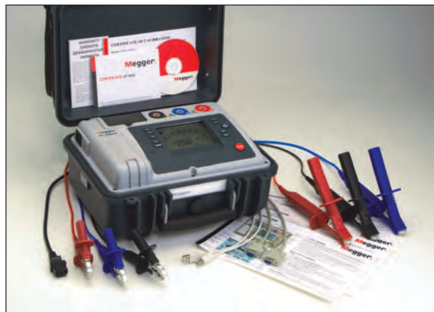
S1-1052/2 shown with included accessories