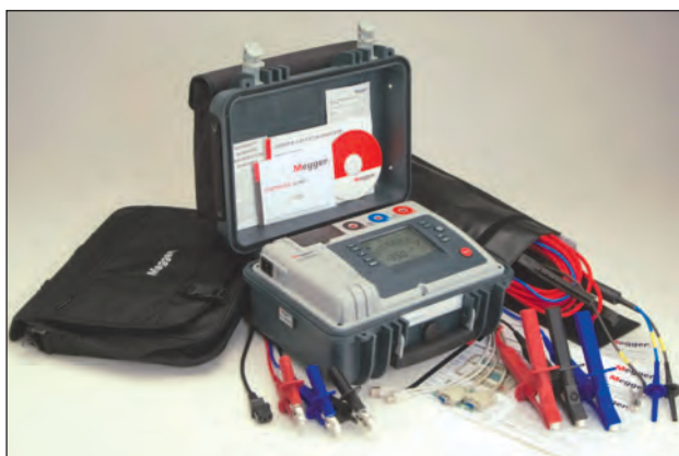
S1-1054/2 shown with included accessories