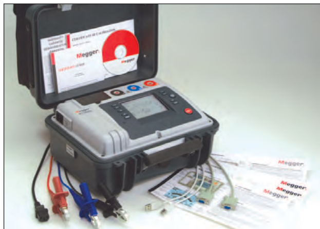
S1-552/2 shown with included accessories