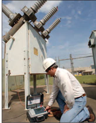
The S1-552/2 in use at an industrial complex substation

All models provide variable test voltages in 10V steps below 1kV and 25V steps above 1kV to enhance their flexibility, and to eliminate the need for multiple IR test sets to meet various applications.